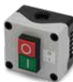
DUAL PUSH BUTTONS