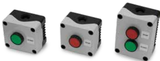
PUSH BUTTON ON/OFF SWITCHES